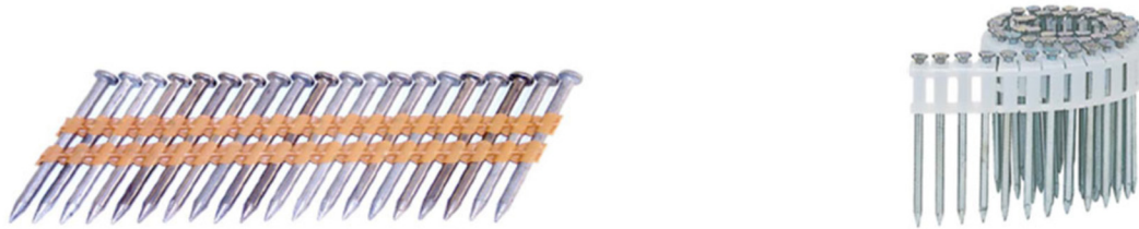
FIGURE 2—AEROSMITH SUREPIN® FASTENER PLASTIC COLLATED FORM