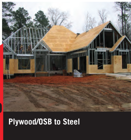
Plywood/OSB to Steel