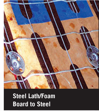
Steel Lath/Foam Board to Steel