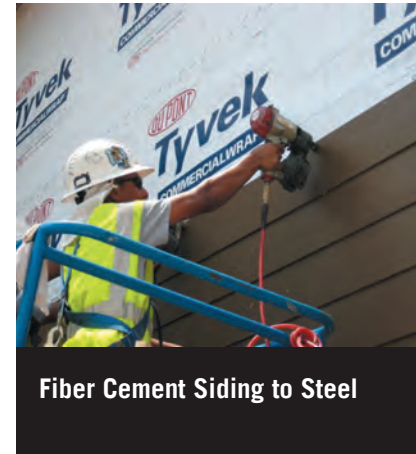
Fiber Cement Siding to Steel