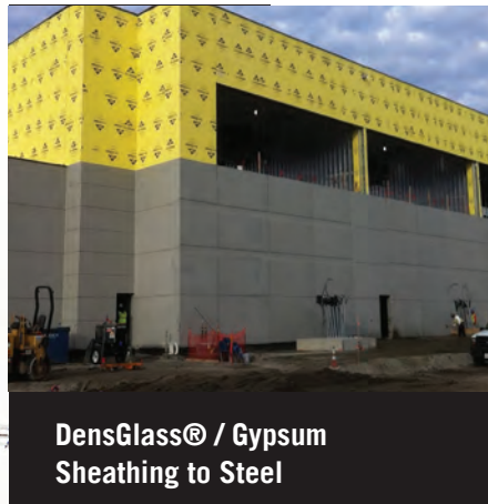
DensGlass® / Gypsum Sheathing to Steel