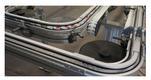
Flexible Chain Conveyors