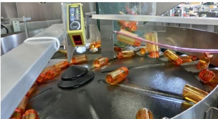
Centrifugal Feeder Bowls