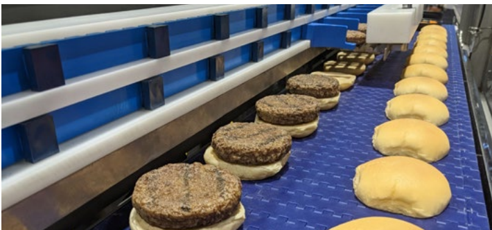
Food Placement Systems