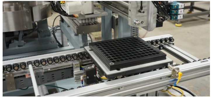
Pallet System Solutions