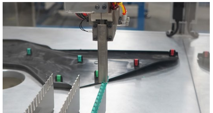
Clip Placement Systems