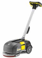
BD 30/4 C BP