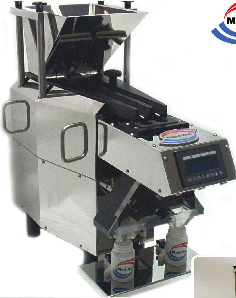
Compact Table Top Counter