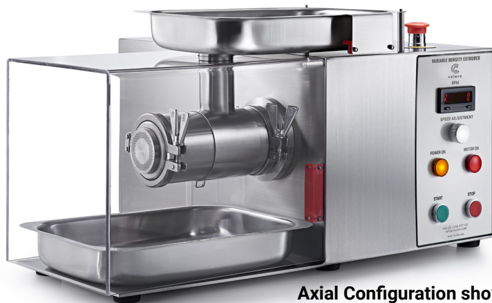
Axial Configuration shown