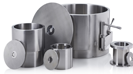
Multi bowl options for all batch sizes