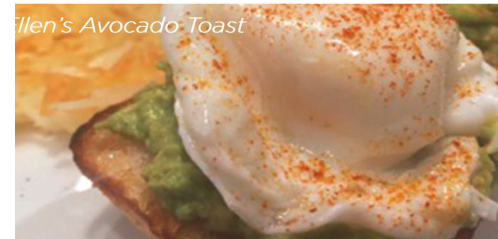
Ellen's Avocado Toast

Two(2) poached eggs on a toasted ciabatta with avocado spread and finished off with a dusting of Paprika. Shredded hash browns. 15.85