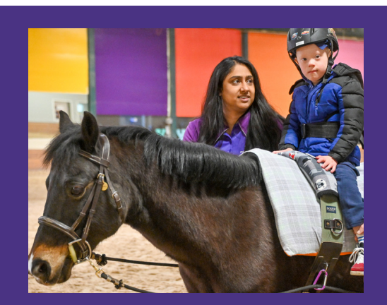
The Children's TherAplay Foundation, Inc. is a not-for-profit outpatient pediatric clinic providing physical, occupational, and speech therapy for children with disabilities. The movement of a horse as a tool is used during a therapy session.

The Children's TherAplay Foundation is a registered 501(c)(3) not-for-profit organization. Tax ID number: 35-2121568. Donations are tax-deductible to the extent allowed by law.