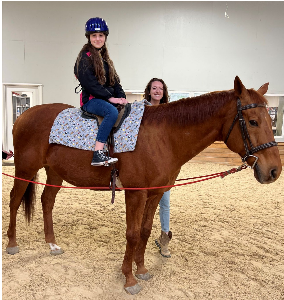
When I come to TherAplay, I ride a horse.