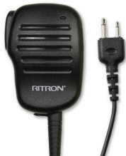
RSM-5XA Speaker Microphone with Rotating Spring Action Clip