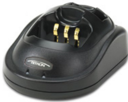
BC-JX Dual Slot Desktop 2.5 Hour Rapid Charger (100-240 VAC, 47-64 Hz) Holds two batteries. Charges sequentially (front to back).