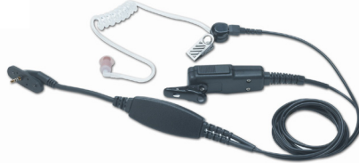
RHD-11X Security Earset with Pendant Microphone, PTT and Clip