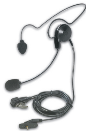
RHD-12X Behind-the-Head Headset with Boom Microphone, PTT and Clip

* For superior durability, all J-Series audio accessories feature a low-profile strain relief connector.