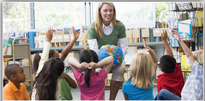
Students and teachers can go about their day knowing they are secured with a communications network limiting access to only approved individuals.

In addition to faster and more appropriate response times, the Ritron callbox enhances school productivity as all teachers and staff members are actively engaged until called.